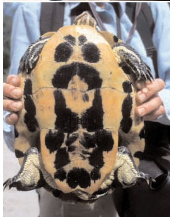
FIGURE 2. Head and plastral views of adult female T. nebulosa hiltoni from Río Cuchujaqui, Sonora, Mexico.

the upper jaw form an acute angle where they join at the midline. The tomial edge of the mandible is not distinctly serrate and choanal papillae are present in the roof of the mouth.