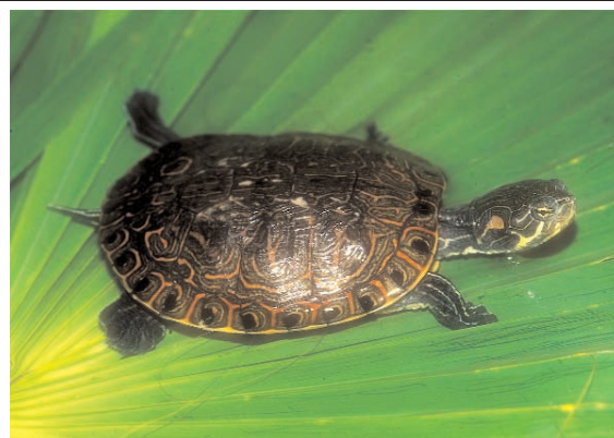
FIGURE 1. Juvenile T. nebulosa nebulosa from El Corro, Baja California Sur, Mexico.

The head and limbs are olive brown with a variety of yellow stripes. The supratemporal (postorbital) stripe is orange and does not contact the orbit of the eye. A yellow vertical bar branches dorsally from the orbitocervical stripe and crosses the tympanum. The throat is pale yellow, mostly without dark markings or clearly defined stripes. The left and right aspects of