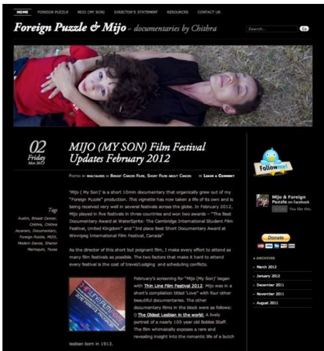
Figure 9: Mijo and Foreign Puzzle Website

independent of Foreign Puzzle and its sole purpose was to create visibility for Foreign Puzzle . So I never created an independent outreach platform for Mijo . Initially, whenever I spoke about Mijo , I told people it was only a short vignette from Foreign Puzzle . I downplayed Mijo and made it vehemently clear that Foreign Puzzle is the real deal.