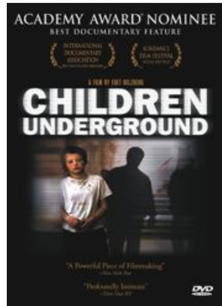
Figure 2: Poster of the film - 'Children Underground'