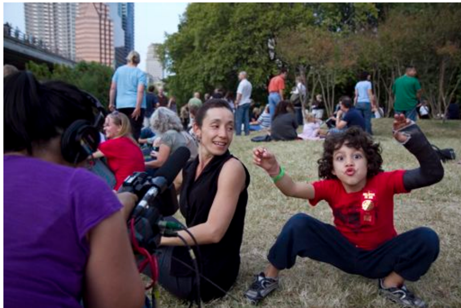
Figure 11: Mijo Production Still