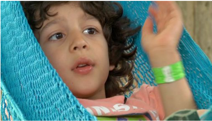
Figure 1: Opening scene of Mijo - Dali defines death.

It is that question by the interviewer and Dali’s answer that helped anchor the entire film, its structure, purpose and the scenes and sequences that follow. Once that decision was