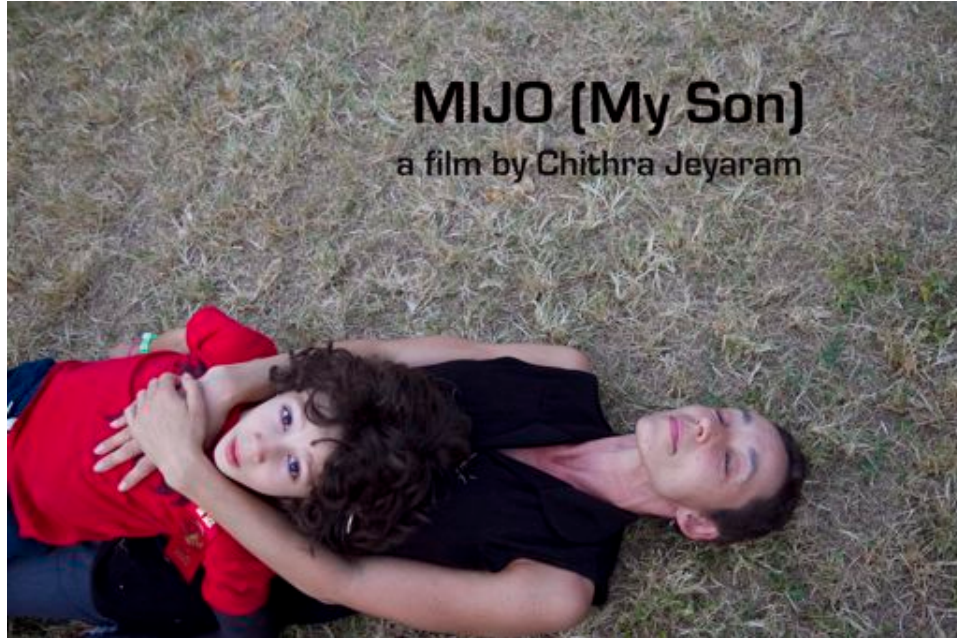
Figure 10: Mijo Postcard