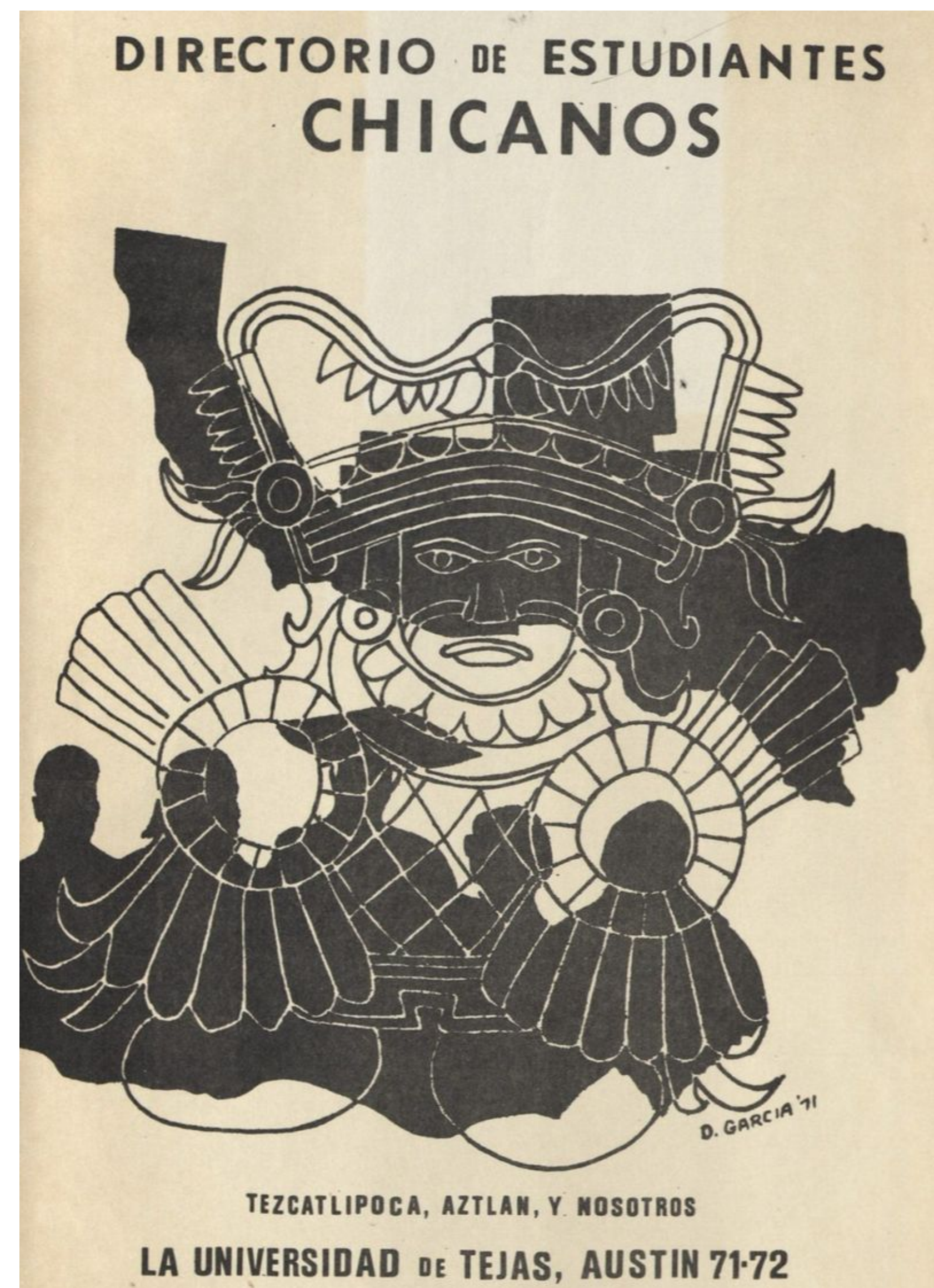
Directorio de estudiantes chicanos. Mexican-American student directory. (1970). Austin, TX: University of Texas Ethnic Student Services.

In this project we used mixed qualitative research methods to examine the communities, spaces, stories, and struggles in the historical fight for educational equality in Austin, Texas. These living landscapes underscore that educational policy is an important site for challenging the ongoing reproduction of institutionalized racism in the United States.