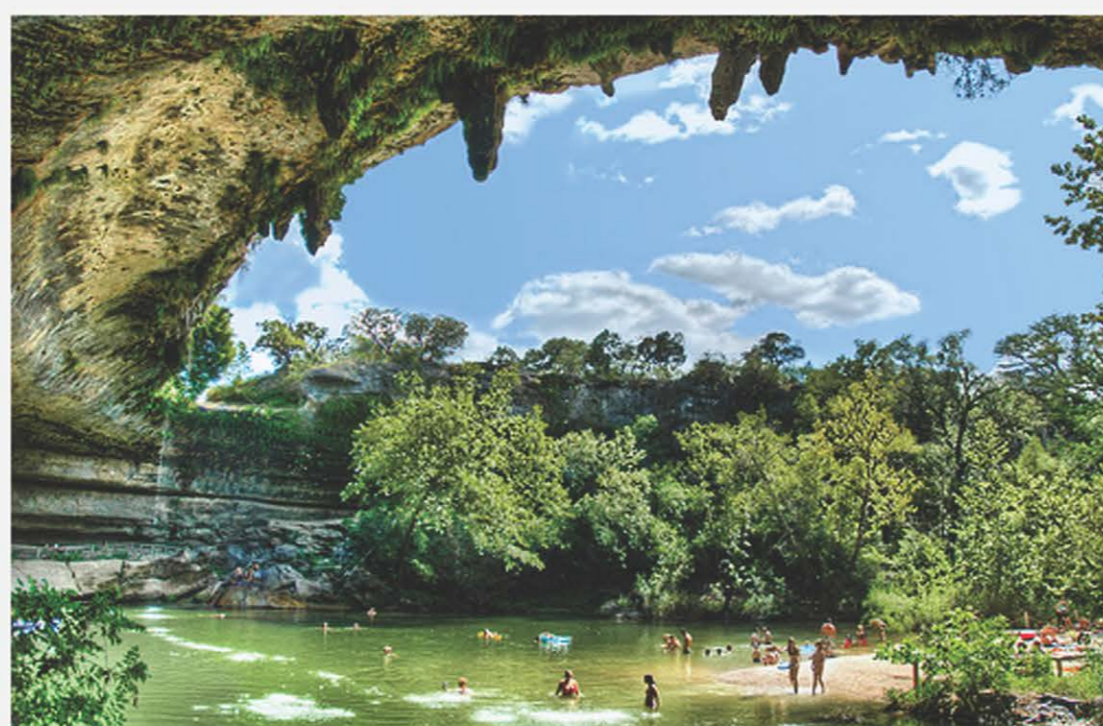
Summer afternoon—summer afternoon; to me those have always been the two most beautiful words in the English language.

We're very happy that, following a few final exams and papers, summer vacation is nearly upon us. Like last summer, we'll be blogging at a more leisurely pace. But you will see the return of a popular feature that we began back in summer 2012: Stories from Summer Vacation . Stay tuned for reports from the UT American Studies community about how folks are spending their well-deserved months of respite (or, in reality, a few months to catch up on work, prepare for fall classes, polish up drafts of books and articles, read for qualifying exams, write dissertations – and occasionally relax!).