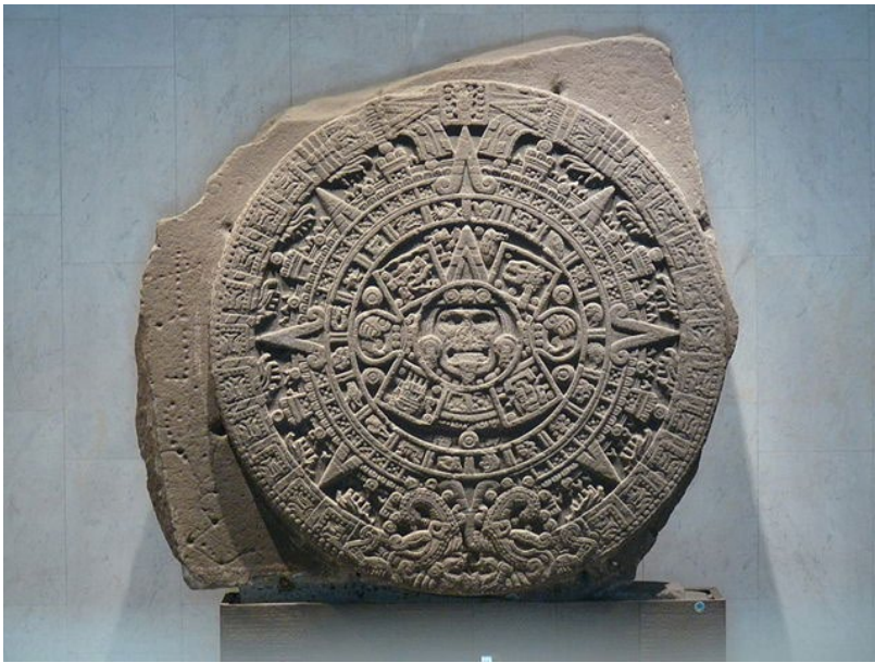
Monolith of the Stone of the Sun, also named Aztec calendar stone.