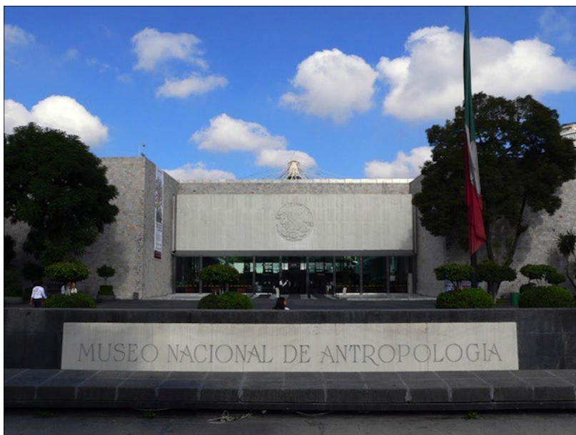
Museo Nacional de Antropología, Mexico. Via Wikipedia.

My favorite history museum, and one of my favorite museums of any type, is the Museo Nacional de Antropología in Mexico City . It is housed in an enormous structure filled with the pre-Columbian culture of Mexico. It covers every civilization, period and style in its artifacts. They are beautifully displayed, perfectly lit and present a dazzling array of forms and colors. There is so much to see, multiple visits are required. I was totally amazed at the richness and variety of cultures. I highly recommend it.