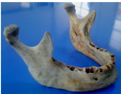
Fig. 1: Dry mandible phantom

In this study, an adult dry mandible (Fig. 1) is taken as a phantom for experimentation to find the volumetric error of the 3D CAD medical model. From the dry mandible, tooth was removed because the density of tooth and bone were different, and this work concentrated on the homogenous bony part only.