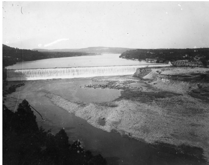
View of the completed Austin Dam, 1890s.

If you cross the Colorado River at Redbud Trail and look upstream toward Tom Miller Dam, there amid the tumbled rocks you can still see the wreck of Austin's dream. In 1890, the citizens of Austin voted overwhelmingly to put themselves deeply in debt to build a dam, in hopes that the prospect of cheap waterpower would lure industrialists who would line the riverbanks with cotton mills. Austin would become "the Lowell of the South," and the sleepy center of government and education would be transformed into a bustling industrial city.