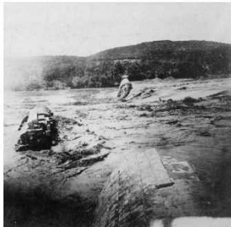
The first Austin Dam in pieces after the April 1900 flood.

Having never lived up to expectations, the dam failed spectacularly on 7 April 1900. Enormous storms upriver sent a torrent of water cascading eleven feet over the crest of the dam. After the rains had stopped, Austinites came out that bright Saturday morning to see their local version of Niagara. Then at 11:20 am they heard a loud crack—"like a gunshot," several said—and watched in horror as a central section of the dam gave way and slid sixty feet downstream. Water blasted into the powerhouse, wrecking it and killing eight people. Lake McDonald vanished, and though the western end of the dam still stood, the eastern half was destroyed. More than a century later, great chunks of it are still to be found scattered in the riverbed, forming part of the present Red Bud Isles.