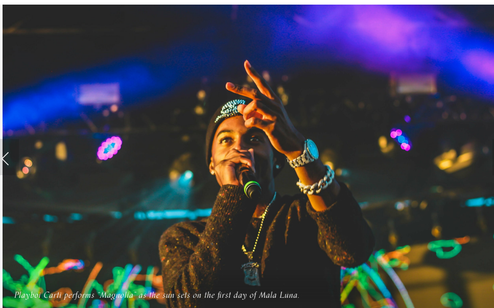
Playboi Carti performs "Magnolia" as the sun sets on the first day of Mala Luna.

Photographing Mala Luna was both unique and exhilarating and although I was more than nervous, being able to shoot these artists from the photo pit is something that I will hold close to my heart forever. In sixth grade, I used to listen to Lil Wayne with my friends and now I can say I took pictures of the rap legend. Thank you ORANGE Magazine and my amazing editors for believing in me enough to send me off to this music festival with this insane lineup. All in all, Mala Luna was spooky, spirited and a huge success.