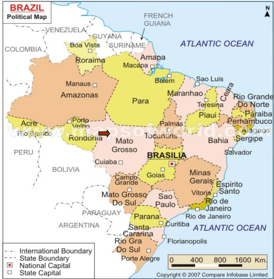
Map of Para, Brazil