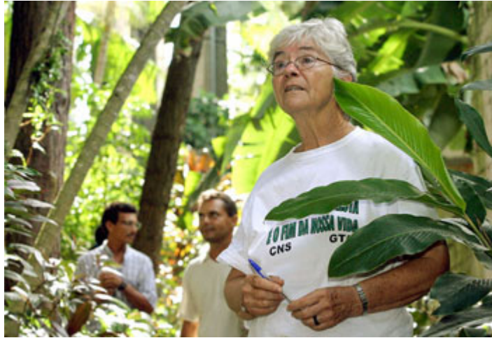
Sister Dorothy Stang in the Amazon