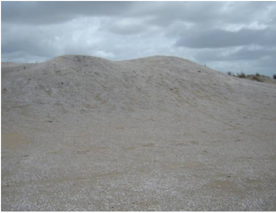
Figure 1 Samabquis mound in Brazil.

a “gateway”, as a culturally unifying element (fig. 2). Also, we believe this project would unite the ideology behind the Rhythms of Life with this indigenous culture in a theme of sustenance and rebirth or regeneration.