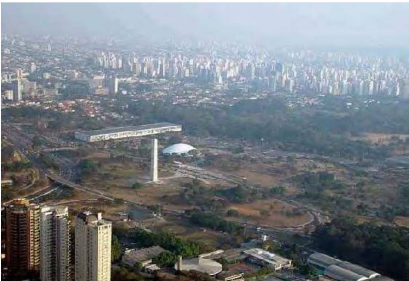
Figure 1. Ibirapuera Auditorium

Concerning motifs for the Brazil project for São Paulo, based on Andrew Rogers’ previous works, we suggest a continuation of abstraction with the possibility of curving and free flowing lines that would represent water, life, and rejuvenation as a way to pay tribute to the inhabitants of São Paulo, and their ability to overcome their country’s drought crisis.