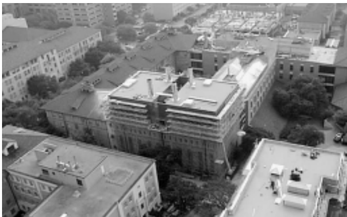
Welch West Wing new HVAC system viewed from the Tower