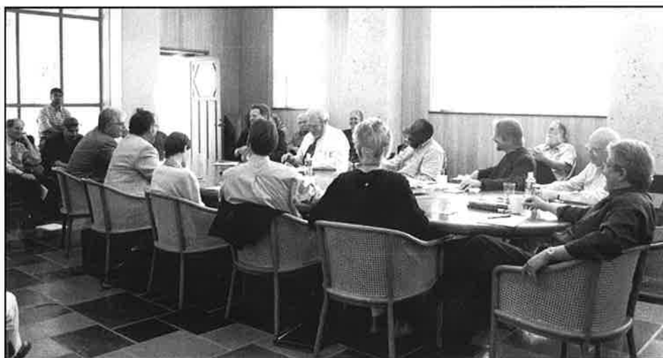
Hassan Fathy Conference, UT