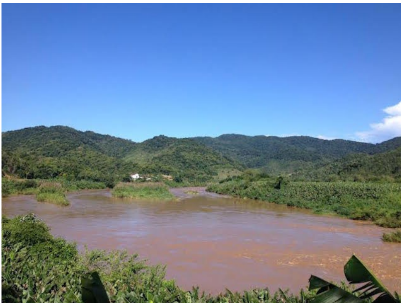
Quilombo of Ivaporunduva and the Ribeira de Iguape River, São Paulo, Brazil.