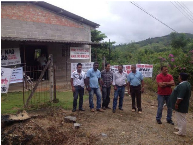
Quilombola activists at a demonstration against proposed construction of hydroelectric dams on the Ribeira de Iguape River in Adrianópolis, Paraná.