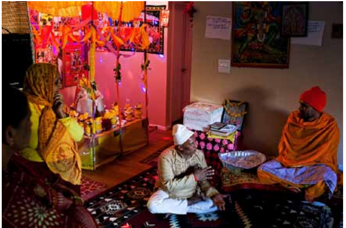
Bhutanese Nepali refugees in Austin, TX.

“An invisible red thread connects those who are destined to meet, regardless of place or circumstances. The thread may stretch or tangle, but will never break.” –Chinese Proverb