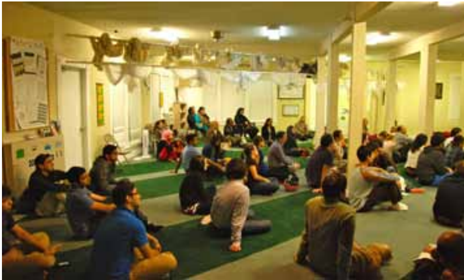
Islamophobia panel discussion held at Nueces Mosque in west campus.