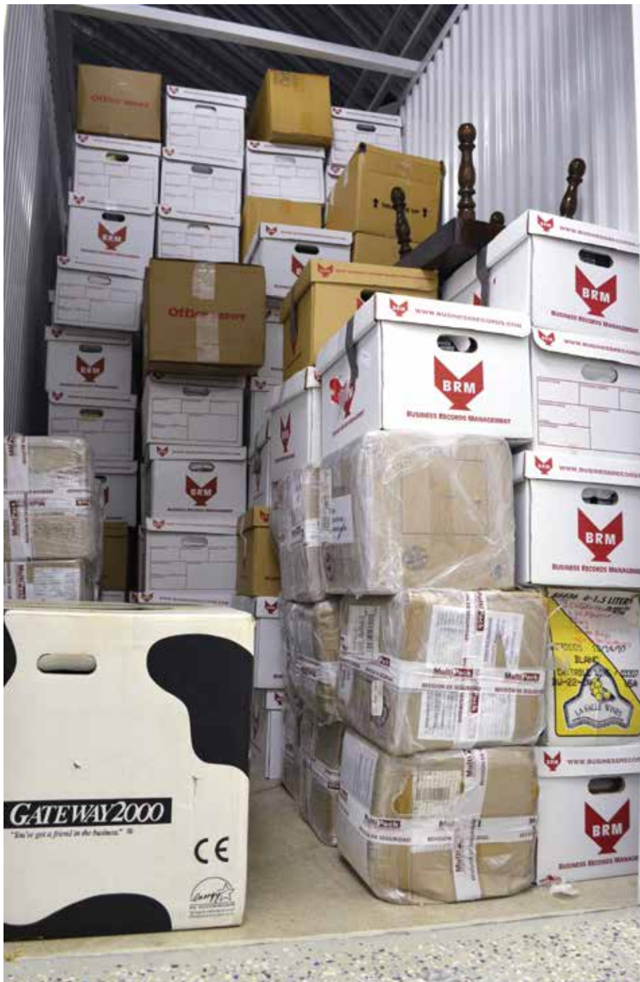
Kaufman archives awaiting processing for AILLA

and fostering collaboration between speakers and scholars of indigenous languages.