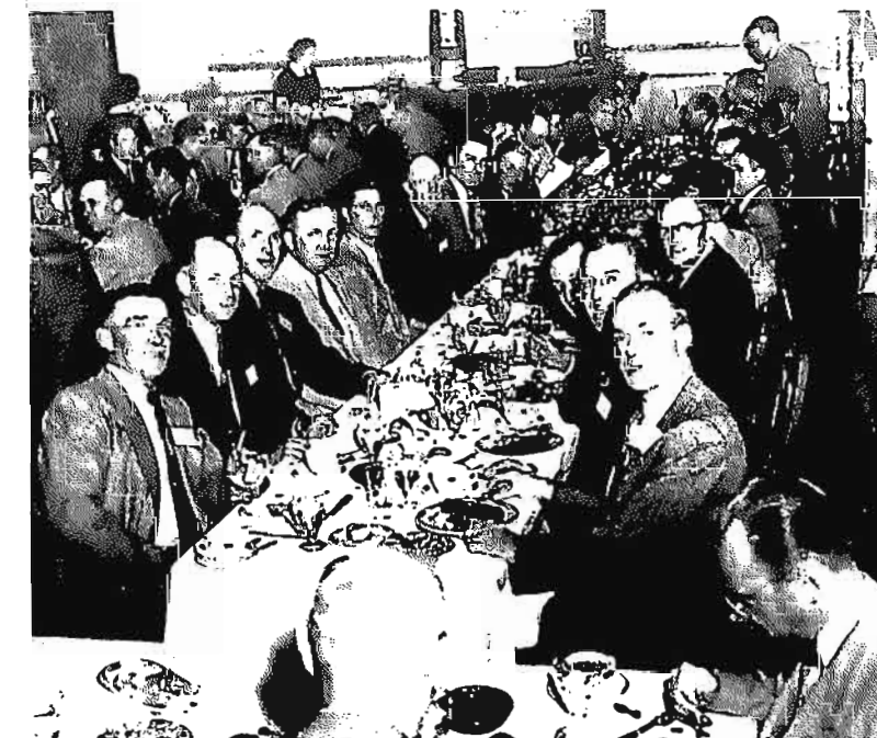
A high point at the Denver meeting — steak serving time!