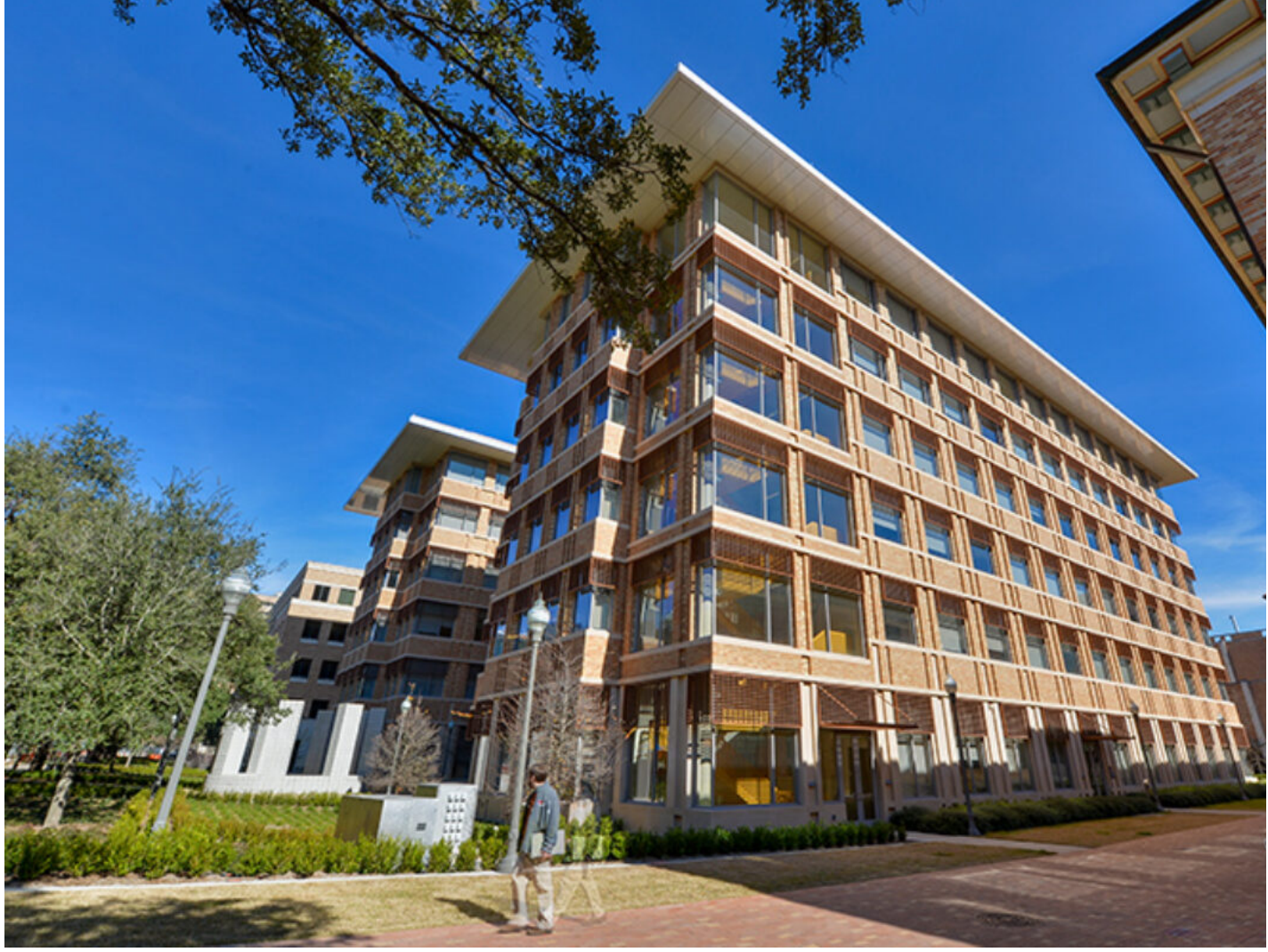
The NSF AI Institute for Foundations of Machine Learning and the Machine Learning Laboratory will be administratively housed in the Gates-Dell Complex at The University of Texas at Austin.

AUSTIN, Texas — The National Science Foundation has selected The University of Texas at Austin to lead the NSF AI Institute for Foundations of Machine Learning, bolstering the university's existing strengths in this emerging field. Machine learning is the technology that drives AI systems, enabling them to acquire knowledge and make predictions in complex environments. This technology has the potential to transform everything from transportation to entertainment to health care.