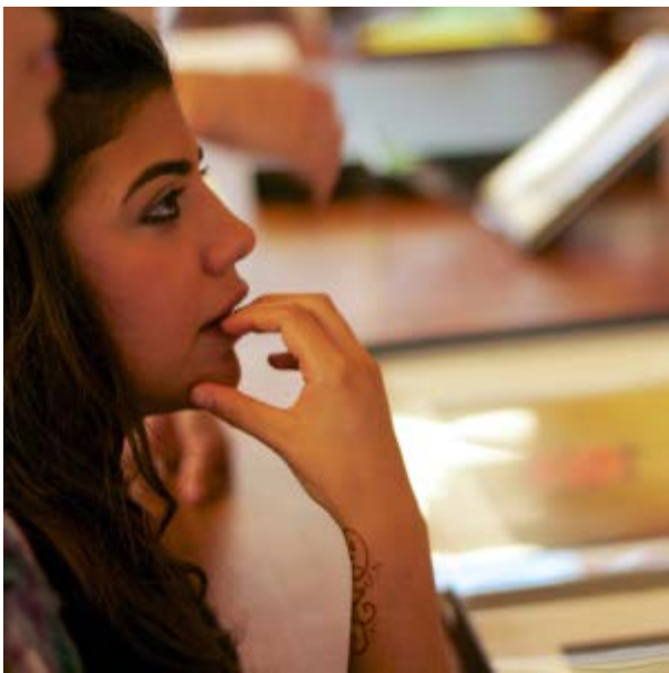
Undergraduate in the class “American Images: Photography, Literature, Archive.”