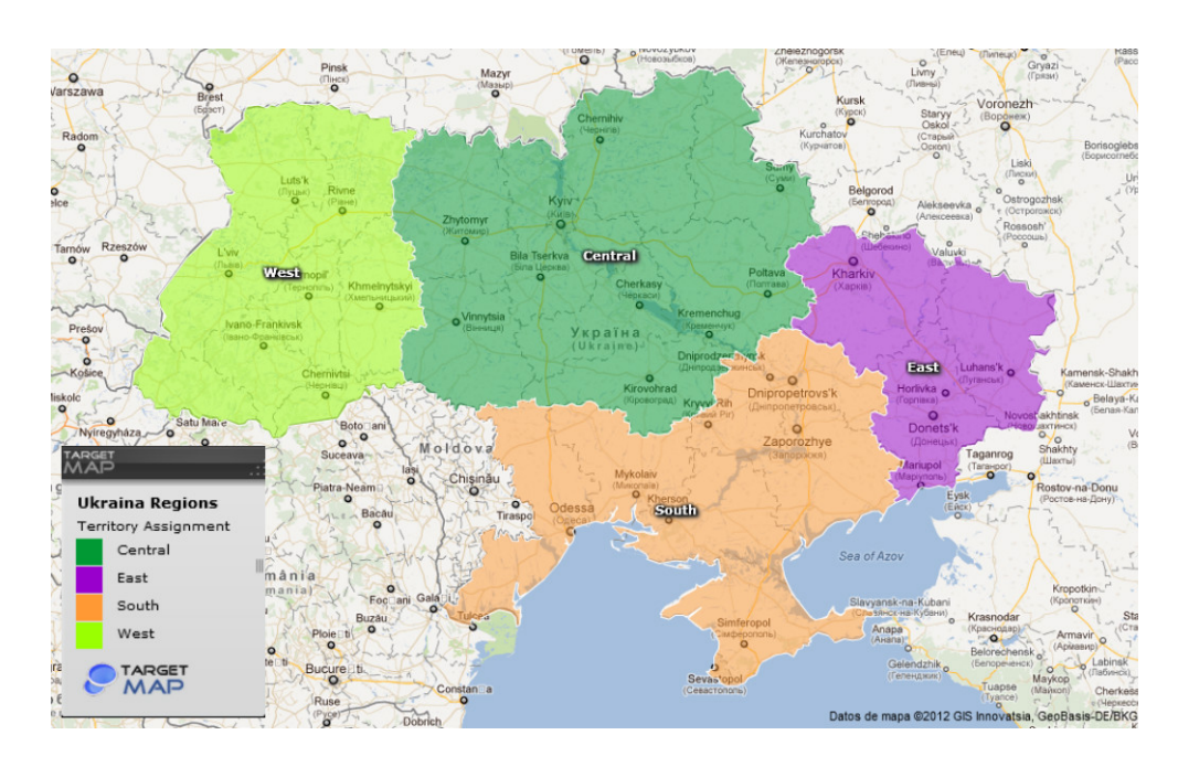
Map of the four regions referenced in the section entitled "Ukrainian Politics and the Teaching of Russian"