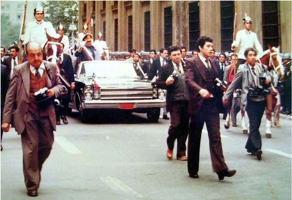
General Pinochet on parade in Buenos Aires, September 11, 1982.