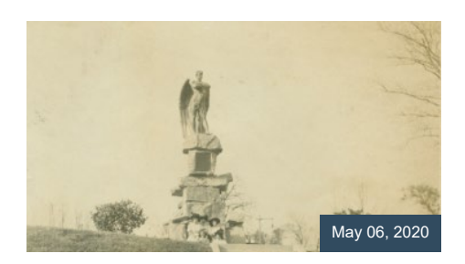
More from The Public Historian

Making History: Houston's "Spirit of the Confederacy"