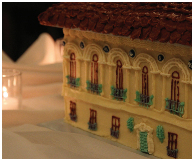
The cake version of Battle Hall.

"A century ago, Battle Hall opened its doors as the first independent library building on the campus of The University of Texas at Austin, and since then it has provided the space and resources