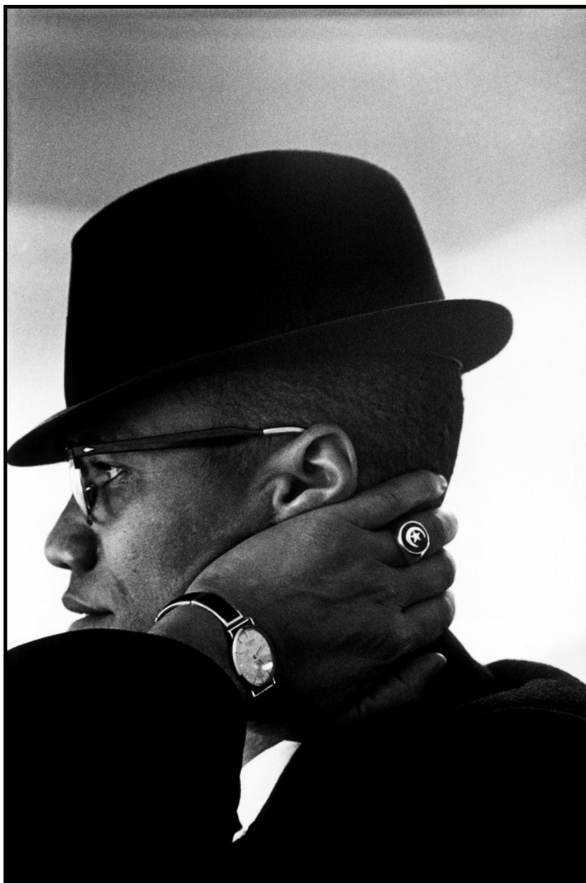
Malcolm X during his visit to enterprises owned by Black Muslims. Chicago, IL, 1962