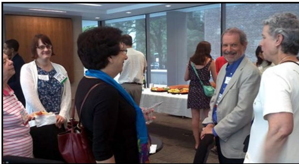
Guests enjoy conversation and kosher food at the ATLA, AJL, CLA Social Gathering

This wonderful ground level venue features floor to ceiling windows, which provided a view of a newly designed and landscaped courtyard bustling with area students, couples hanging out and parents with children running about, as well as our guests approaching the building to join our reception.