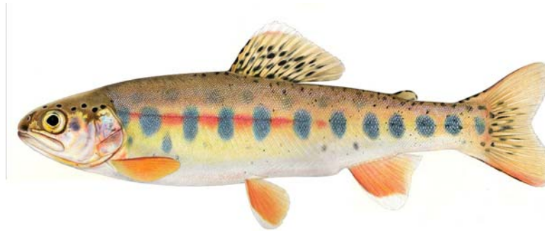
Figure 2. Joe Tomelleri's illustration ® of juvenile Conchos trout

We cannot emphasize enough the urgency of taking immediate steps to save this exceedingly rare and threatened trout. The impending extinction of this species will affect Rarámuri tradition as well as the local biodiversity. We were fortunate to have located the population we describe, but the situation requires immediate implementation of recovery actions. We are prepared to do whatever we personally can to help conserve this new species, but we clearly need help. Interested collaborators and donors are invited to contact us via the following: