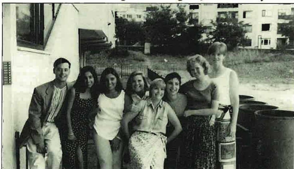
American Students in Turkey with Program Coordinator

In the summer of 1994 ten students from North American universities participated in a six-week summer program at Boğaziçi University in Istanbul, Turkey. The program was organized by The University of Texas at Austin and the University of Illinois at Urbana-Champaign.