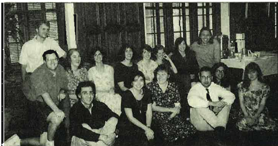
Members of CMES Graduate Student Organization at tea party for Spring 1994 graduates

It's funny, the one place I didn't see as much of this was the Golan Heights. There, the attitude is different, kind of a nervous holding pattern, no one wanting to make a move. I was up there visiting two old friends. To me, they were really representative of the settlers in the Golan that I've had contact with. Dovish on the peace process in every way except...you can see the pain in their faces when they talk about the negotiations with Syria. They are simply holding their breath, yet not wanting to be too vocal about the outcome. They are so different from the settlers in the West Bank and Gaza. I really saw none of the militancy and the constant flaunting of current policies.