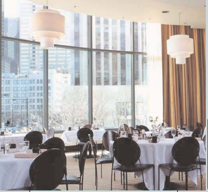
WESTIN TABOR CENTER HOTEL

ICAR's 12 TH SYMPO-SIUM will feature presentations on current aggregates issues in concrete, asphalt, and unbound pavement layers. In addition to these topi<u>cal</u> areas, we will have papers on new testing procedures, characterization of materials for various uses, and the application of new techniques to field practice.