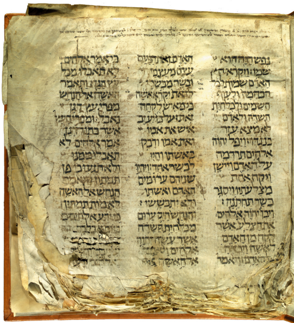
Page from a Sefer Torah from Spain, 1188.

Judaica collections such as those found in the Fisher Library are invaluable resources for teaching and research in Jewish studies. They complement and add depth to the extensive Judaica holdings in U of T's Robarts Library. The Toronto Jewish community should be proud that such a significant collection of Judaica and Hebraica exists in its midst. It's my hope that more members will make use of this collection and help it grow by contributing to the library so that we can build on this excellent resource and make it even richer and stronger.