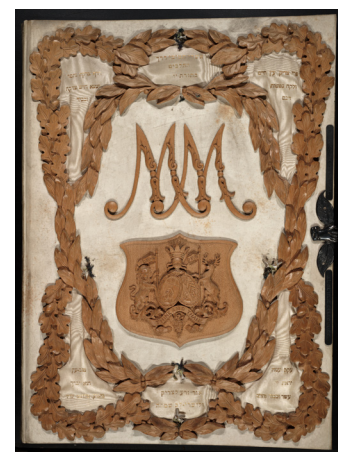
The decorative cover of a commemorative album presented to Moses Montefiore in 1884.

Also of great historical significance is a commemorative album presented to Montefiore, the prominent Jewish leader and philanthropist, on his 100th