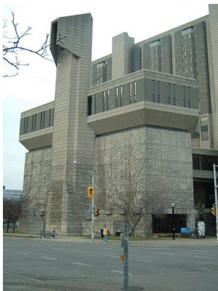
The Thomas Fisher Rare Book Library is home to the University of Toronto's special collections.

to the Fisher Library, and while there was a fair bit of publicity about it at the time, this collection remains one of Toronto's best kept secrets. Manuscripts are the preservers of the intellectual heritage of the Middle Ages, both Jewish and non-Jewish. Despite the ravages of time, and the extremely precarious position of the Jews in many medieval communities, some 80,000 Hebrew