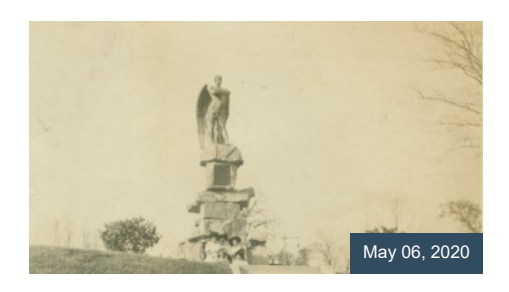
More from The Public Historian

Making History: Houston's "Spirit of the Confederacy"