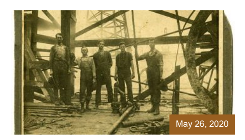
More from Texas