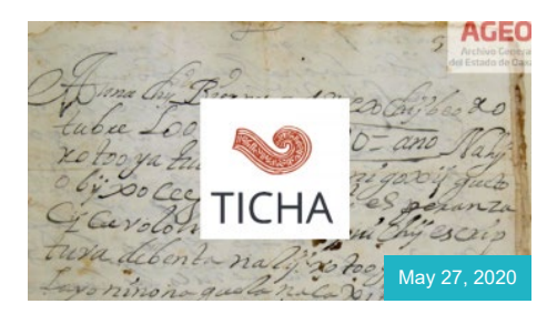
More from Digital History

Starting with an examination of Bavarian marriage, Strasser notes that people explained their attitudes toward marriage and sexuality in the context of competing religious and secular judicial discourses. The Catholic Church wished to have all couples marry, regardless of social status, in order to affirm their respect for the sacrament in marriage and avoid licentious behavior. The state, on the other hand, took a rather paradoxical approach to marriage with its establishment of Munich's marriage bureau. Of the utmost importance to the marriage bureau was a bride's virginal status. If a woman was not a virgin, the union was unlikely to be approved by the marriage bureau. The state saw this virginal prerequisite to marriage as a way to prevent poor people from procreating outside of marriage, and reduce sexually licentious unions. However, in addition to virginal status, the marriage bureau also scrutinized the financial stability of couples. On top remaining chaste, the prospective spouses also had to prove they were capable of providing for a family. For the poor couples, this was often difficult to achieve. Therefore, the creation of the bureau resulted in marriage becoming a type of social status reserved for the upper echelons of society.