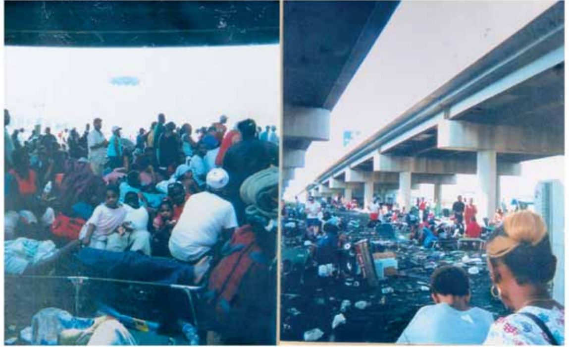
ASHÉ CULTURAL ARTS CENTER/BABA TUNJI