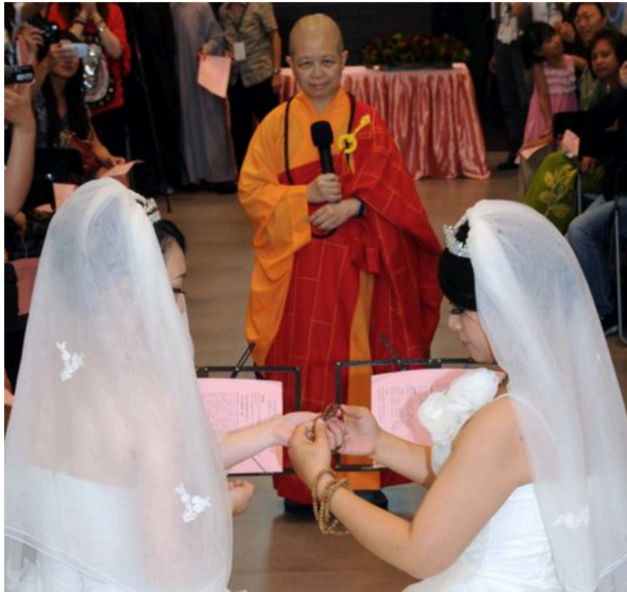
Figure 3: The first-ever Buddhist lesbian wedding

2012, the world's first-ever Buddhist lesbian wedding took place in Taiwan and was performed by an influential Buddhist nun, Ven. Shih Chao-Hwei who is a key figure in supporting tongzhi rights (Taiwan's First Same-Sex Wedding, 2012). Since 35% of Taiwanese are Buddhist followers (approximately 8 million people) and since religion has traditionally been considered the opposite force of non-heterosexual union, this historical event became the landmark of Taiwan's LGBTQ+ rights advancement, while the powerful image from the wedding of the lesbian couple standing in front of the Buddhist nun before a giant Buddhist statue fortified the compulsory marriage.