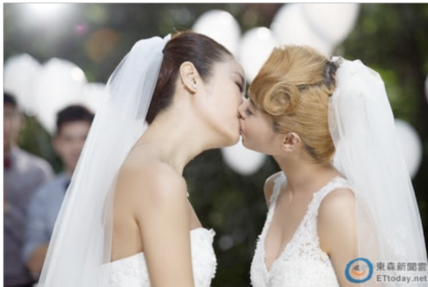
Figure 4: Jolin kisses an actress in her music video (Jolin Tsai’s Official Channel, 2014)

In December, 2014, one of the most popular pop singers in Taiwan, Jolin Tsai, who has a wide fan base in Asia and worldwide, made a music video for her song “ We are different, yet the same ” from an adaptation of a true story of a lesbian couple, who have been together for 36 years yet still faced legal and medical discrimination. The music video starts with an elderly woman (A) lying on a hospital bed about to receive an emergency surgery while another elderly woman (B) anxiously stands beside her. When the hospital staff comes to obtain a signature for the consent form and asks about B’s relationship with A, she could only say they are friends. The hospital has to get the A’s nephew to come and sign on the consent form. A does not survive the surgery and passes away. Heartbroken, B finally tells the hospital staff that “she is my wife” when she comes to pick up her lover’s belongings, and this is when the story goes into an imaginary flashback of the two women, young again, getting married in the white wedding dress.