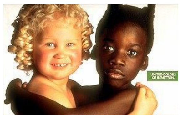
Table 2: United Colors of Benetton Ad