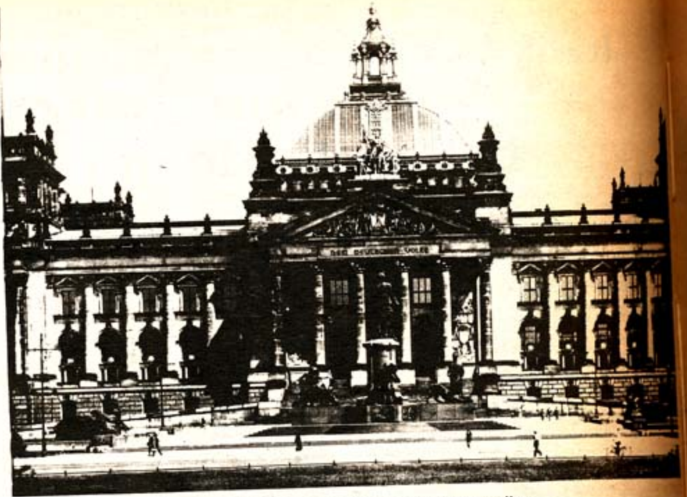
Reichstag, ingoro y'intumwa za rubanda na n'ubu iracyariho.

"Ni bwo bwa mbere abadepite barigatishwaga ubugi bw'iterabwoba ry'abananguzi, batamitswe n'ubutegetsu bwa Leta. Abasirikari bo ku ruhembe rw'imbere binjirana amakamyi mu mihanda hose mu Budage, abananguzi bakiroha mu nzu batagarura ibyitso, bakabikoranyiriza mu bigo SA aho inkoni n'urw'abashinyaguro byari bibategereje.