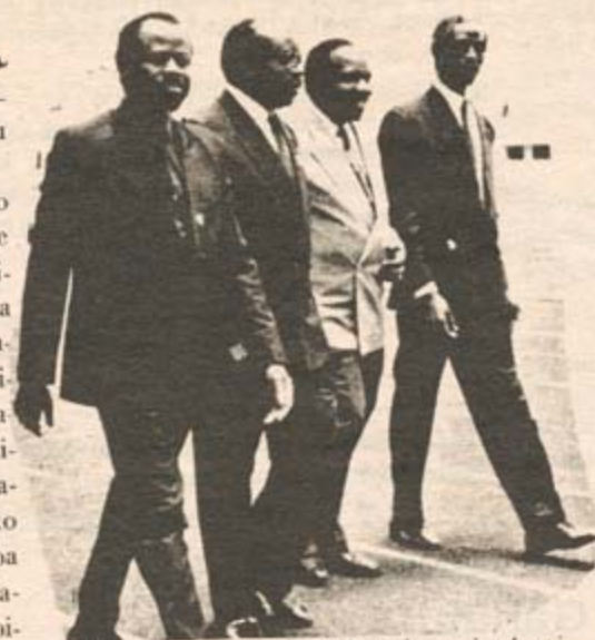
Aba bagabo nibature basobanurire Impirimanyi Inkotanyi abo aribo nicyo bashakaga. Uwigira ihwa rizahanda abandi imyaka ine amenye ko ariho asenya ishyamba nawe atiretse.

KARAMIRA yagize ati izo Nkotanyi ntizari zikwiye no kuvugana arizo zateye. Ati Ingabo z'abafaransa zari zikwiye ahubwo no kwimuka zikajya hagati y'u Rwanda n'Ubugande. Kuko MDR ivugira abaturage, ibabajwe rwose n'impunzi za FPR kimwe n'iza MRND na CDR. Karamira yunzemo ati: intambara yari iya gisirikare igiye kuba iy'abaturage birengera. Noneho ngo FPR yavugiraga impunzi z'abatutsi, none ikaba ishimishijwe no kugira impunzi miliyoni y'abaturage, irabona ko abo batutsi ibihumbi 500 baziyungana na miliyoni bate? FPR yabeshye abantu ngo irarwanira uburenganzira bw'ikiremwa-muntu. Bajya gutera bwa mbere bemezaga ko Habyarimana yamaze abantu, none ejo bundi bati tujye kumuhana. Ba-