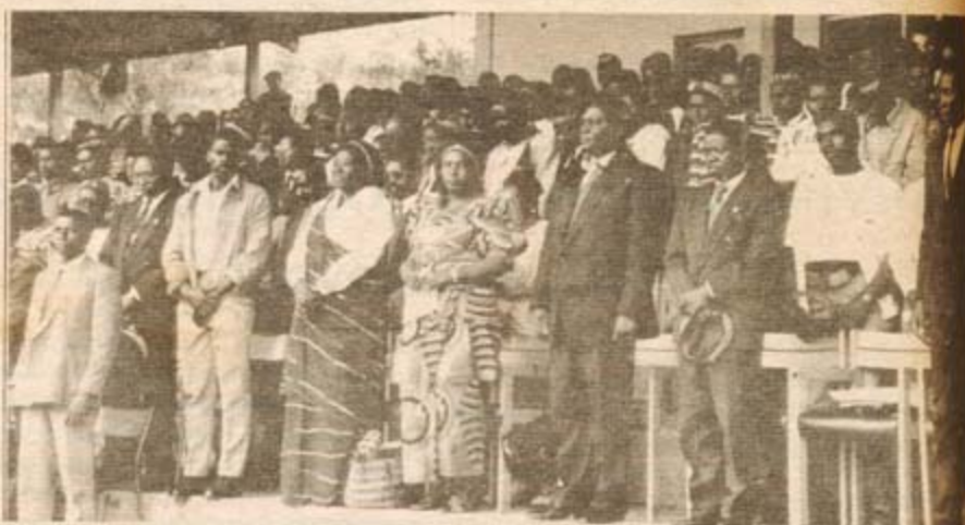
Habyarimana n'Interahamwe ze nibagire babise abanyarwanda bazima bitegekere igihugu cyabo

Tumaze kumenya ko muri MDR hari bamwe mu bagize biro Politiki basiba inama kenshi, ndetse ngo bakaba babigirwamo inama na bamwe mu bakuru b'ishyaka baba batinya ko hafatwa ibyemezo ibi n'ibi badashaka.