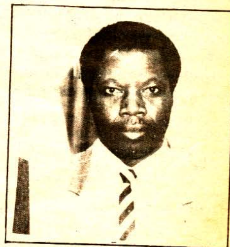
CYPRIEN NTARYAMIRA PEREZIDA MUSHYA W' U BURUNDI