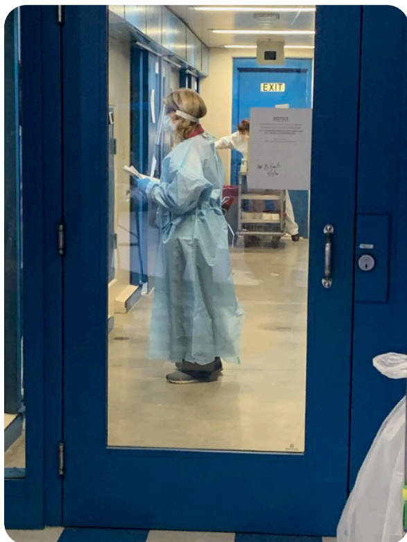
Washington State Office of the Correctional Ombuds, Monitoring Visit to Monroe Correctional Facility, Medical isolation unit with COVID-positive individuals, April 10, 2020

Washington Office of the Corrections Ombuds (OCO): The OCO has continued facility visits throughout the coronavirus pandemic, conducting thematic inspections to determine how prisons are responding and adapting to the crisis. OCO staff conducted these visits, using personal protective equipment, in response to concerns in specific prisons about COVID-related conditions and the implementation of safety and sanitation procedures. The first inspection after the COVID breakout took place on April 10, 2020, following a mass disturbance resulting from tensions surrounding fear of the spread of the virus. The OCO has published reports on each of the facility visits, including its findings about the disturbance and the steps the agency is taking to protect incarcerated people during the COVID crisis.