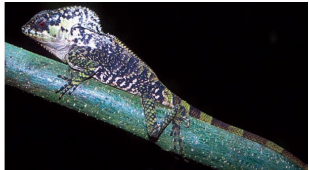
FIGURE. Juvenile (top: USNM 559556) from Bodega de Río Tapalwás, and adult (USNM 559547) from Caño Awawás, Depto. Gracias a Dios, Honduras.

dorsal scales can be much larger than surrounding scales. Lateral body scales are imbricate and usually smooth; most lateral body scales are smaller than dorsal scales. The middorsal scale row is enlarged, forming a serrated dorsal crest with triangular-shaped scales extending from the shoulder region to the base of the tail; the middorsal crest is more prominent anteriorly and is continuous with the well-developed nuchal crest. A serrated row of scales forms a distinct to indistinct ventrolateral fold. Ventral scales are large, imbricate, and strongly keeled with rounded to broadly rounded posterior ends; some ventral scales also are mucronate. Subdigital scales are strongly keeled. Caudal autotomy is absent. Femoral and preanal pores are absent.