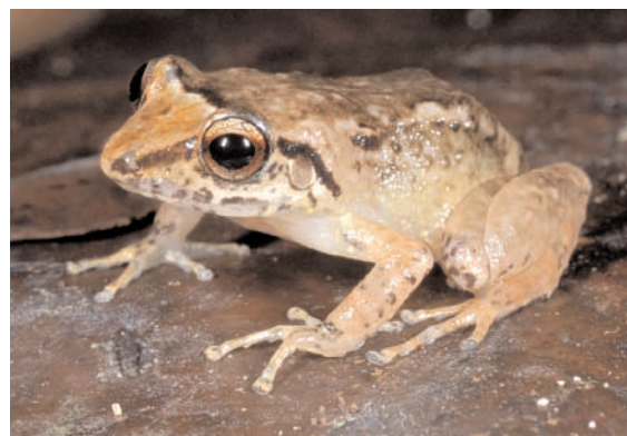
FIGURE 1. Adult male Eleutherodactylus amplinympha from the trail to Boeri Lake, Commonwealth of Dominica.