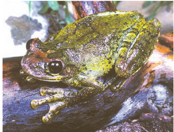
FIGURE 1. Osteopilus vastus from an unknown locality.

• DIAGNOSIS. Osteopilus vastus is distinguished from all other Hispaniolan hylid frogs by the combination of well-developed webbing on the hands (barely webbed in O. pulchilineatus ) and a conspicuous fringe on the outer edge of each limb (absent in H. heilprini , O. dominicensis , and O. pulchilineatus ).