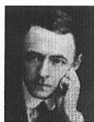
Arnold Bax (1883-1953)