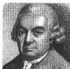
C. P. E. Bach (1714-1788)