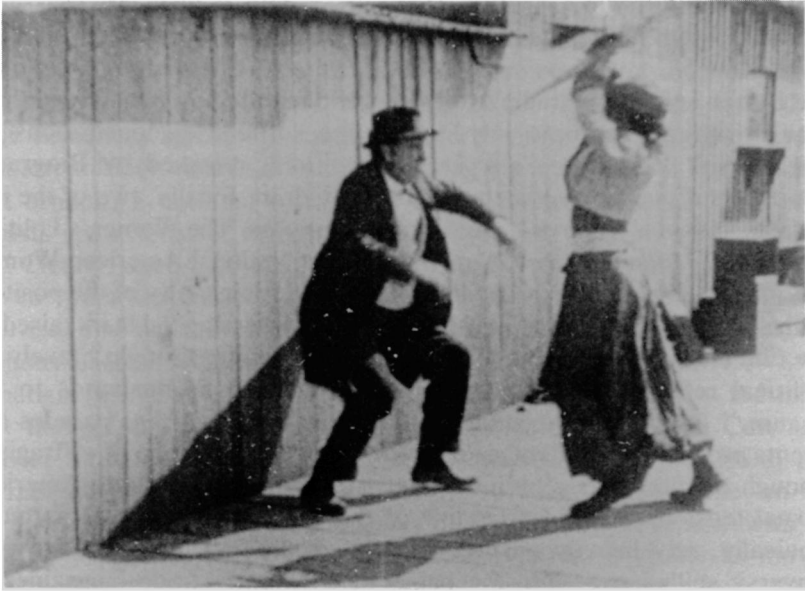
Charlie Chaplin, on the right, plays a suffragette who brutalizes a cringing man in A Busy Day .

suffrage movement's own films raised issues about women's roles which are still debated today, and the silent films offer a fascinating excursion into American sexual politics. Unfortunately, very few of the early films have survived. When silent films lost their commercial viability within several years after release, the early film companies, eager for fast production and quick profits, carelessly discarded them. Often the companies themselves were too short-lived to maintain their films. The perishable silver nitrate stock on which the films were printed further reduced their chance of survival; thus those that exist today are rare cultural documents. Since they have been scattered across the country in often obscure film archives, the suffrage films have been sadly neglected by both film historians and suffrage movement scholars. 1