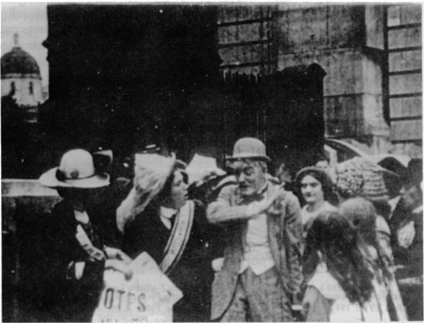
The hero of A Suffragette in Spite of Himself emphatically assures his female rescuers that he is not interested in their cause.

Edison's A Suffragette in Spite of Himself (1912) allowed the suffragettes to have the final word. When two young boys pinned a 'Votes for Women' sign on the unsuspecting hero's back, antisuffragists taunted the confused man. He fought back frantically, resisting the police when they dashed up to arrest him. Suffragettes further complicated this "comedy of errors" as they descended upon the police to protect their "ally." But the bewildered gentleman emphatically assured the women that he was not interested in their cause, and staggered home only to find that his maid had impishly planted a 'Votes for Women' banner beneath his bourbon bottle. Again, the opportunistic Edison conveyed a double message: the "antis" he portrayed seemed as hysterical as the suffragettes. Earlier suffrage satires, however, made a less ambiguous statement. The stand-