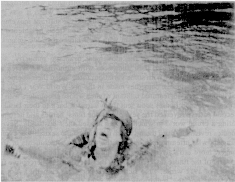
In the last scene of A Busy Day , the suffragette meets her demise after her humiliated male companion pushes her into the ocean.

for women. In a single act, he won both the hand of his lover and the gratitude of his future mother-in-law. Despite the determination of the domineering suffragist, it required the efforts of a wily man to win her political goal for her. Even then, of course, it was only through magical intervention that he succeeded. Edison thus added a unique twist to the traditional comic themes: this time the film's happy ending included both votes for women and a salvaged romance. How They Got the Vote managed to straddle the suffrage fence, presenting a stereotyped view of suffragists while it reconciled the family with women's political equality.