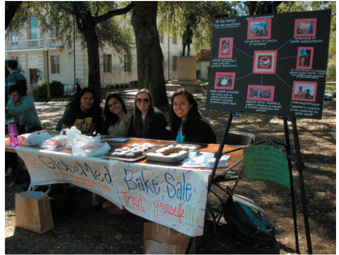
Undergraduate students participating in the 2nd Annual Human Rights Fair.

During the fall semester, the HRSAC organized a campus-wide canned food drive with the help of the Capital Area Food Bank, the largest hunger-relief organization in Central Texas. At the end of the spring semester,