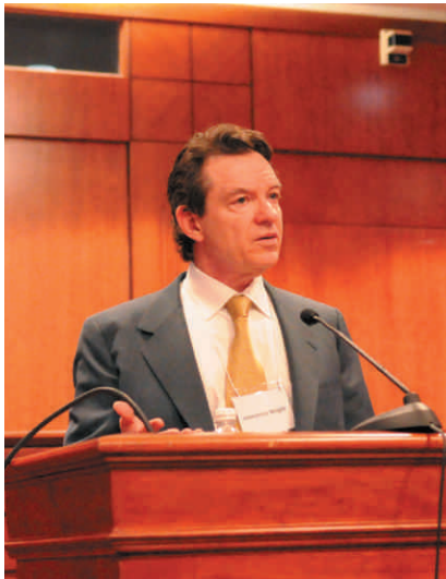
Pulitzer Prize-winning author Lawrence Wright ( The New Yorker) discusses the future of terror and violence.