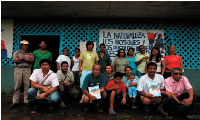
Teribe community members with a copy of the Human Rights Clinic report.

To date, the Human Rights Clinic (HRC) has sent two student groups to Costa Rica to document the implications of the El Diquís Hydroelectric Project, a state-planned mega-dam on the Térraba indigenous reserve. Data collected by students in the spring of 2010 led to a report by the HRC entitled "Swimming Against the Current." I formed part of the second group, which visited Costa Rica in the fall of 2010 to present the report to relevant government officials, NGOs, interested (and uninterested) media, and the Teribe community itself.