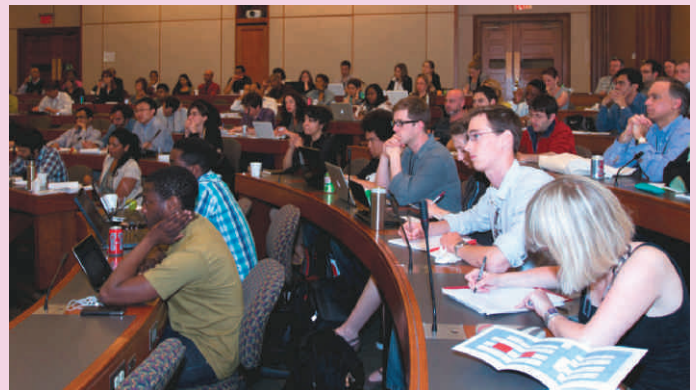
IGLP Workshop participants during one of the plenary sessions.