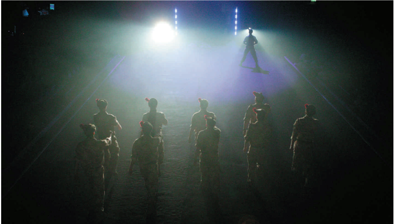
A moving scene from the performance of Gregory Burke’s play, Black Watch , which explores the aftershocks of conflict as experienced by members of a Scottish infantry battalion in the Iraq War.

Conference participants reconvened the following day in panels