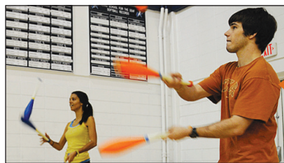
Catch this: Juggling generates brain tissue. LIFE&ARTS PAGE 10

In 1954, The first color television sets using the NTSC standard are offered for sale to the general public.